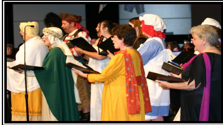
Branch County Community Chorus