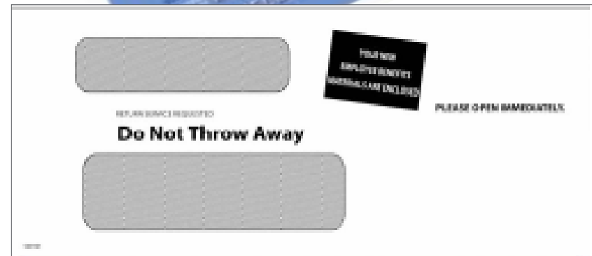
Sample of the envelope the HSA Visa Debit card comes in.