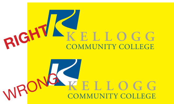
LOGO ON COLOR

When the logo is placed on a field of color (i.e. yellow), the color should be allowed to show thru the mark. A white square should NOT be put behind the mark.