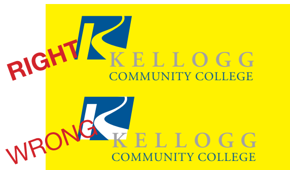
LOGO ON COLOR

When the logo is placed on a field of color (i.e. yellow), the color should be allowed to show thru the mark. A white square should NOT be put behind the mark.